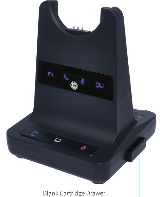
conceals port for optional USB or Bluetooth Cartridge Module

SKU: UK/EU:575-385-001, USA: 575-385-002