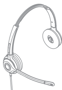
PLX QD HEADSET